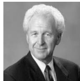
1991 Frank Sortino Objective-based investing