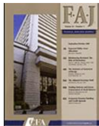
1986 Financial Analysts Journal Determinants of Performance