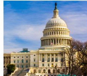
1974 ERISA Fiduciary Governance